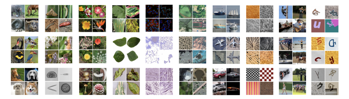
Figure 1: Meta-Album sample images. Each column represents one domain and each row one set. Domains are arranged in the same order as in Table 2.

We introduce Meta-Album, an image classification meta-dataset designed to facilitate few-shot learning, transfer learning, meta-learning, among other tasks. It includes 40 open datasets, each having at least 20 classes with 40 examples per class, with verified licences. They stem from diverse domains, such as ecology (fauna and flora), manufacturing (textures, vehicles), human actions, and optical character recognition, featuring various image scales (microscopic, human scales, remote sensing). All datasets are preprocessed, annotated, and formatted uniformly, and come in 3 versions (Micro \subset Mini \subset Extended) to match users' computational resources. We showcase the utility of the first 30 datasets on few-shot learning problems. The other 10 will be released shortly after. Meta-Album is already more diverse and larger (in number of datasets) than similar efforts, and we are committed to keep enlarging it via a series of competitions. As competitions terminate, their test data are released, thus creating a rolling benchmark, available through OpenML.org. Our website https://meta-album.github.io/contains the source code of challenge winning methods, baseline methods, data loaders, and instructions for contributing either new datasets or algorithms to our expandable meta-dataset.1